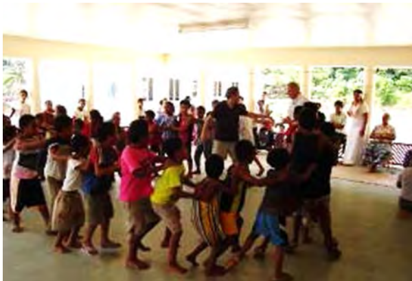
Promoting calming – Image Charles Waldegrave

Some speakers talk about the risks and costs of human flight. People are in fact drifting back to Christchurch and it's good to hear that. But there are huge challenges for everyone, and indeed the physical and infrastructure restoration seems almost easy, compared to the human side.