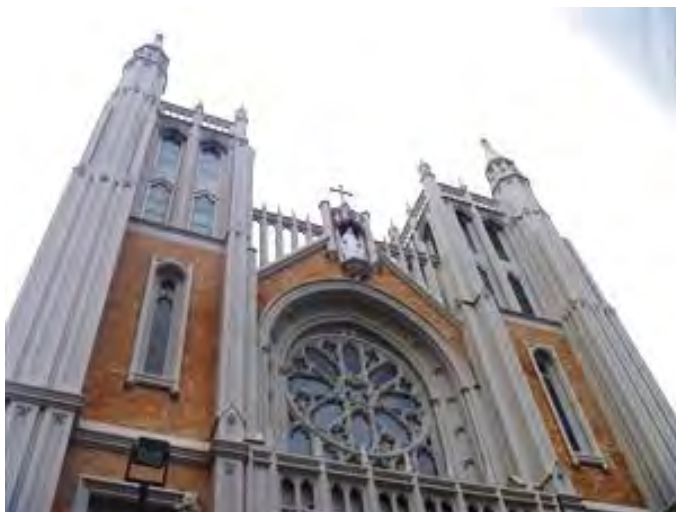
We have to look at our heritage buildings differently.

The city went their own way and produced some pretty pictures. They also produced another set of regulations, compounding the frustrations of people – like permanent buildings, no less than 3 storeys in height, and no more than 7 storeys. The architects went out and did exercises. Finally, after they talked to their insurers and realised that it’s going to be more expensive to upgrade the buildings than to redo them. So we have a city now that has a density less than Berlin at end of the Second World War.