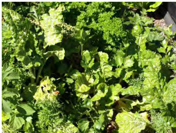
Farmers markets create a sense of community

We set up the first Time Bank in New Zealand. It is going really well and has played a significant role in rebuilding our future after the February 2011 earthquake. People share their skills with one another – measuring by the hour, not the dollar. And everyone's time is regarded as equal. Civil Defence was called into action too – they didn't normally have a presence in Lyttelton. The Time Bank is about sharing skills, hour on hour. We have a population of 3000, with over 400 people registered. So we have a system that works – we might send out broadcasts saying that we need people to take a chimney down, whatever the need – it is strongly coordinated. We link with other services too.