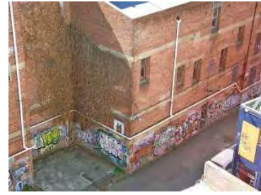
Brick building - Wellington CBD. Courage is needed to make the hard decisions around these types of buildings.

The infrastructure – I could talk for hours about infrastructure. There's three or four billion dollars worth of work to be done there. It's maybe a 5, 6, 7, maybe an 8 year programme. Already, we're doing work at two or three times the rate you would normally see in Christchurch. The scale of it is quite extraordinary.