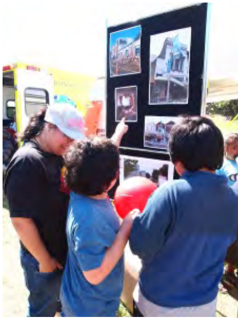
Get people together before a seismic event

Lifeline restoration and recovery times for city services in Wellington could be described as work-in-progress. I think we'd all agree that the timings indicated, which are the current consensus, are just not acceptable for our community. Let's look at water, which is a basic necessity. Even if a building is okay, it's not OK to occupy it if there is no water in the pipes. Things might be okay for a day or so, as people use bottled water for drinking - but it's not going to work for us in the long-term. So we're investigating how to mitigate those 40 or 50 days with no bulk supply – by increasing reservoirs around the region for example. While the extra reservoirs won't replace the bulk supply, they may give residents sufficient water to refill their containers.